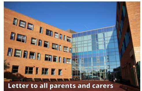
Letter to all parents and carers

We're always happy to celebrate great artwork from our students, and even more so when it has been created during a lockdown. Take a few moments to enjoy some of this great artwork that has been created at home by students from across the age ranges. Fair warning to any arachnophobes, there's a realistic looking spider in the gallery!