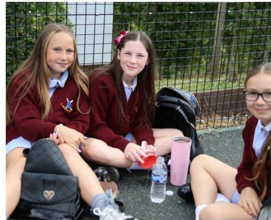
Transition Day 2026! On Wednesday we had a fantastic day with our incoming Year 7 students. We're really looking forward to meeting again in September!