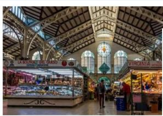
Valencia Central Market