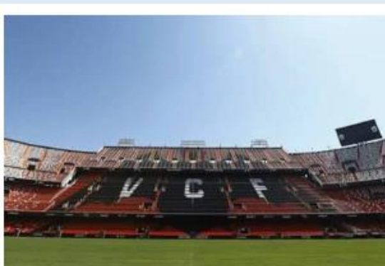
Valencia FC - Mestalla Forever Tour