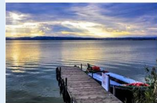
Albufera Lake Boat Trip