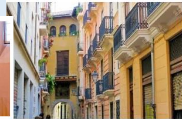
Valencia Old Town